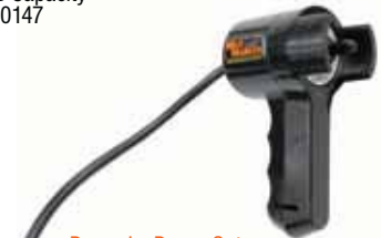
Power-In, Power-Out Remote Control